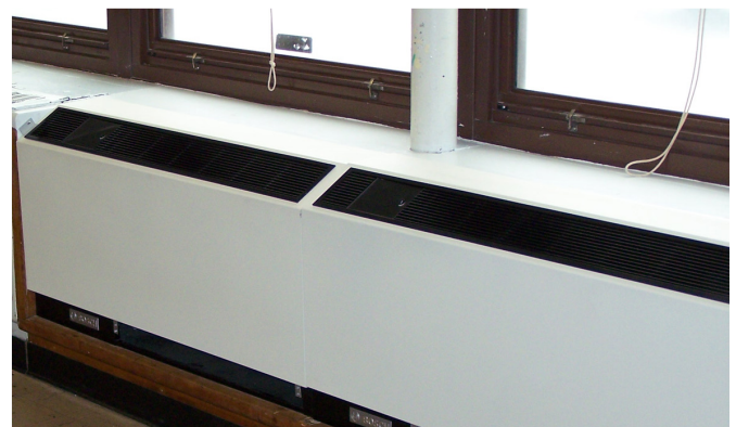
Bosch console units provide custom comfort in classrooms.

DiEnna added that the system maintains the school at a steady temperature, regardless of the weather outdoors. "The kids aren't too hot or too cold," he said. "It gives them an environment for more effective learning."