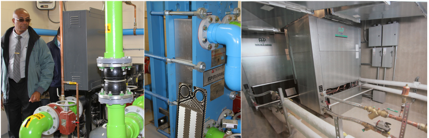
Bosch technical engineer Edgton Wright (left) examines water supply system inside the pump building; flat plate heat exchanger (center) transfers heat from utility's water system to a water/glycol loop through the building. (right) Bosch FHP water-to-air geothermal heat pumps installed in building crawlspace provide conditioned air via ductwork and are fed by water/glycol piping.

Many U.S. schools do not have year-round heating and cooling, but the use of computer technology has dramatically increased the building's internal heat gain, creating an uncomfortable environment in the classrooms. Geothermal technology delivers comfort year-round. The advantage of a ground source heat pump is that in cooling mode, the water/glycol solution extracts heat from the rooms and transfers it to the utility's water through the heat exchanger and in reverse, for heating mode, the water/glycol solution extracts heat from the utility's water through the heat exchanger and sends it into the rooms. With the geothermal heating system in place, there's no extra cost to have a cooling system.